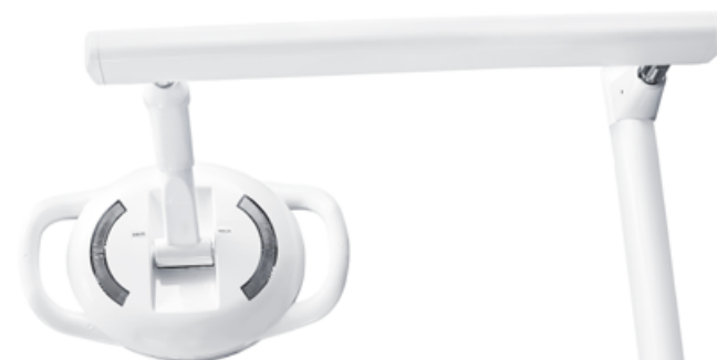
腰枕头枕 Lumbar and Headrest

The sub-control panel is equipped with a 4.3-inch medical-grade LCD screen operating interface – supporting touch-proof design and featuring waterproof and dustproof performance, ensuring smooth operation even with gloves on; both strong and weak suction tips are made of removable and sterilizable silicone material, providing a tight fit without air leakage.